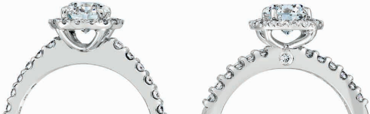
ROUND BRILLIANT CUT DIAMONDS