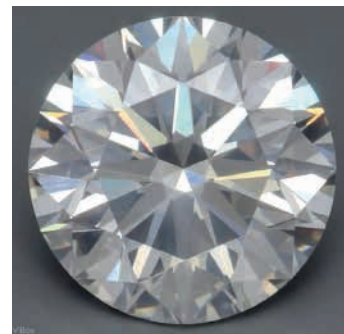
Milky or hazy 1ct G VS2 fluorescent diamond