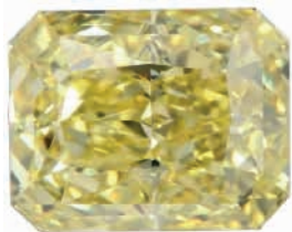
Fancy Intense Yellow