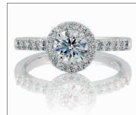
The finished ring