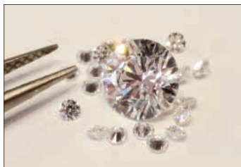
The finest gems