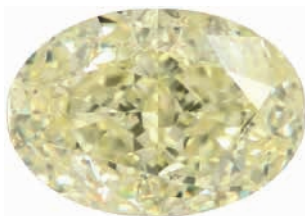
Fancy Light Yellow

Attractive natural coloured diamonds are rare. Advances in cutting technology have resulted in more saturated and evenly coloured diamonds. As the appearance of yellow diamonds has improved, so has their popularity. Garry Holloway has worked with three other members of an international collaboration known as the Cut Group, who have led advances in fancy colour cutting. Their work has enabled pale coloured rough diamonds to display richer and more beautiful colours. Below are the 4 GIA lab grades of yellow diamonds that we stock. Fancy Light Yellow diamond cost less than colourless white diamonds. Vivid Yellows cost around twice as much.