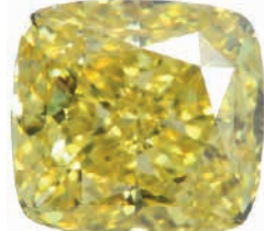
Fancy Vivid Yellow