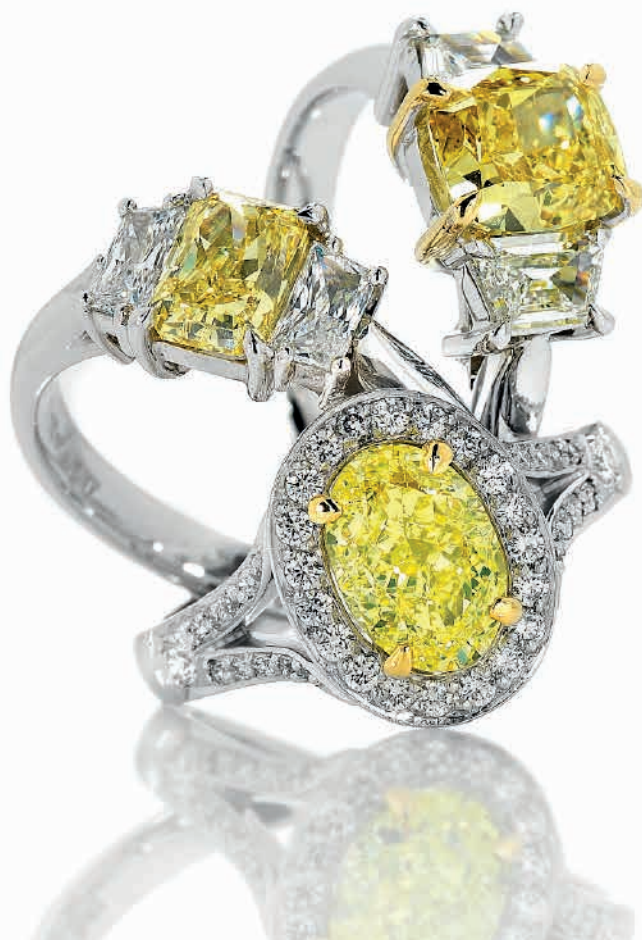
FANCY COLOURED DIAMONDS