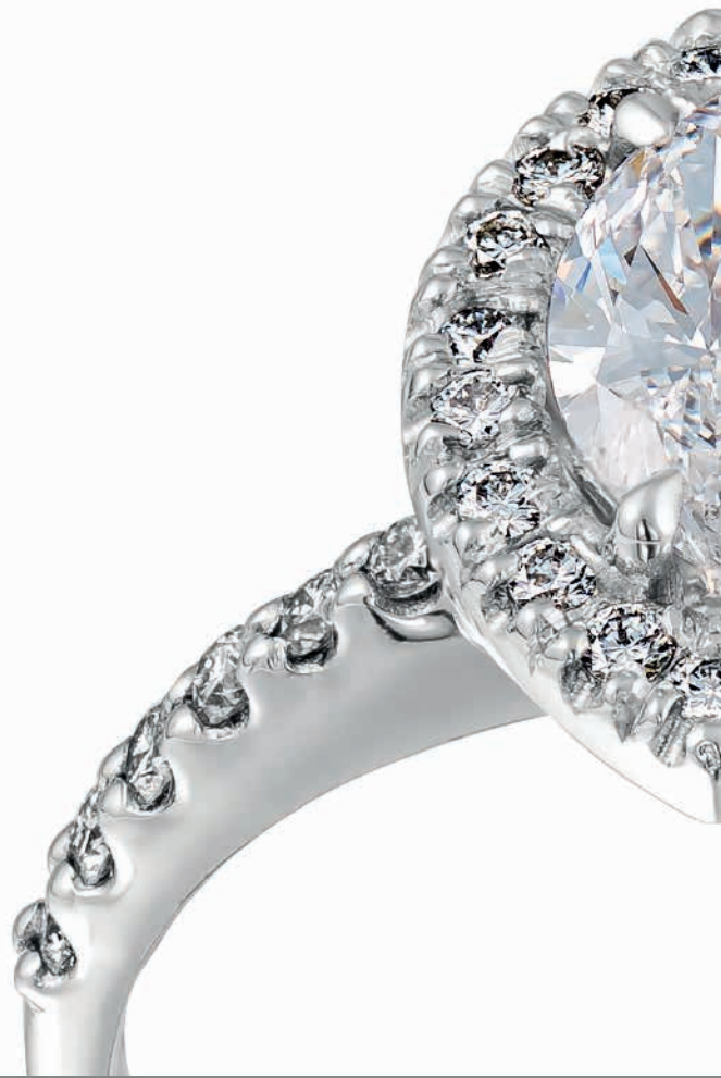
FANCY SHAPED DIAMONDS