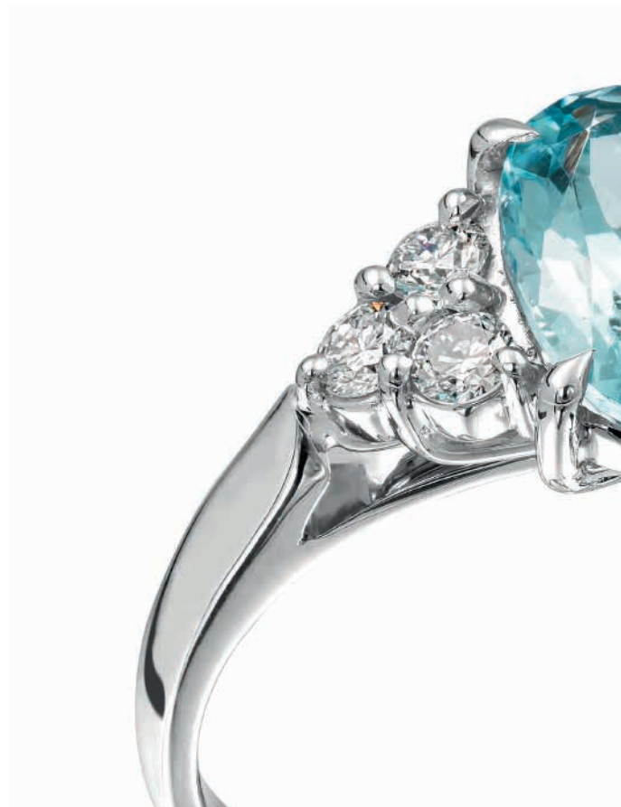
COLOURED GEM STONES