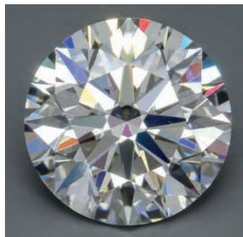
Crystal clear brilliant 1ct G VS2 fluorescent diamond

A third of all diamonds glow from a faint to very strong blue in ultraviolet (UV) light. Research fluorescence online and you will find support for the myth that fluorescent diamonds are of poor quality. Many in the industry prefer to promote negativity toward fluorescence because of a lack of understanding, knowledge and expertise. Fluorescence has very different effects in individual diamonds. While some may look dull and