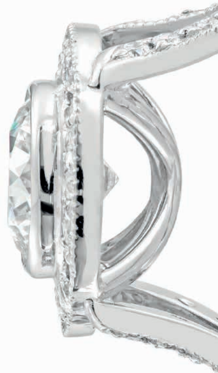
ROUND BRILLIANT CUT DIAMONDS