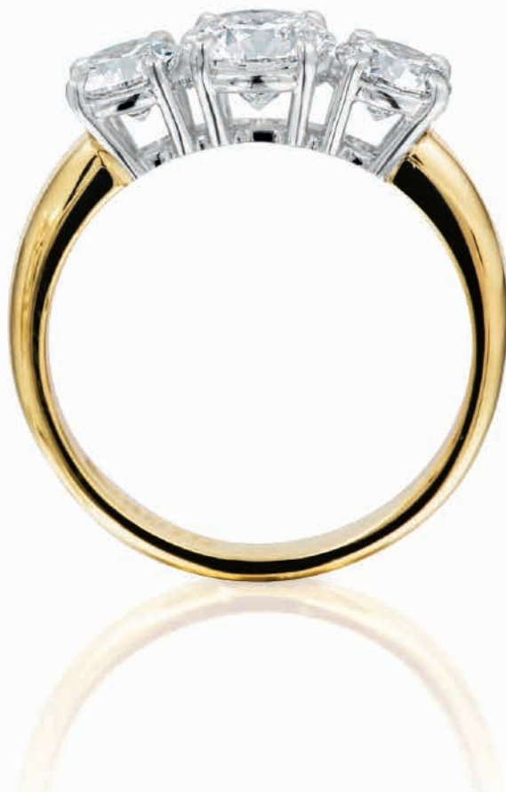
ROUND BRILLIANT CUT DIAMONDS