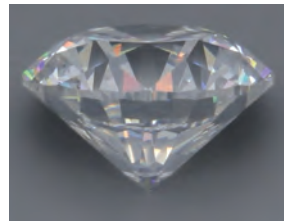
Milky or hazy 1ct G VS2 fluorescent diamond