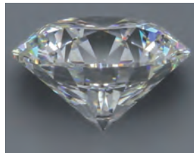
Crystal clear brilliant 1ct G VS2 fluorescent diamond